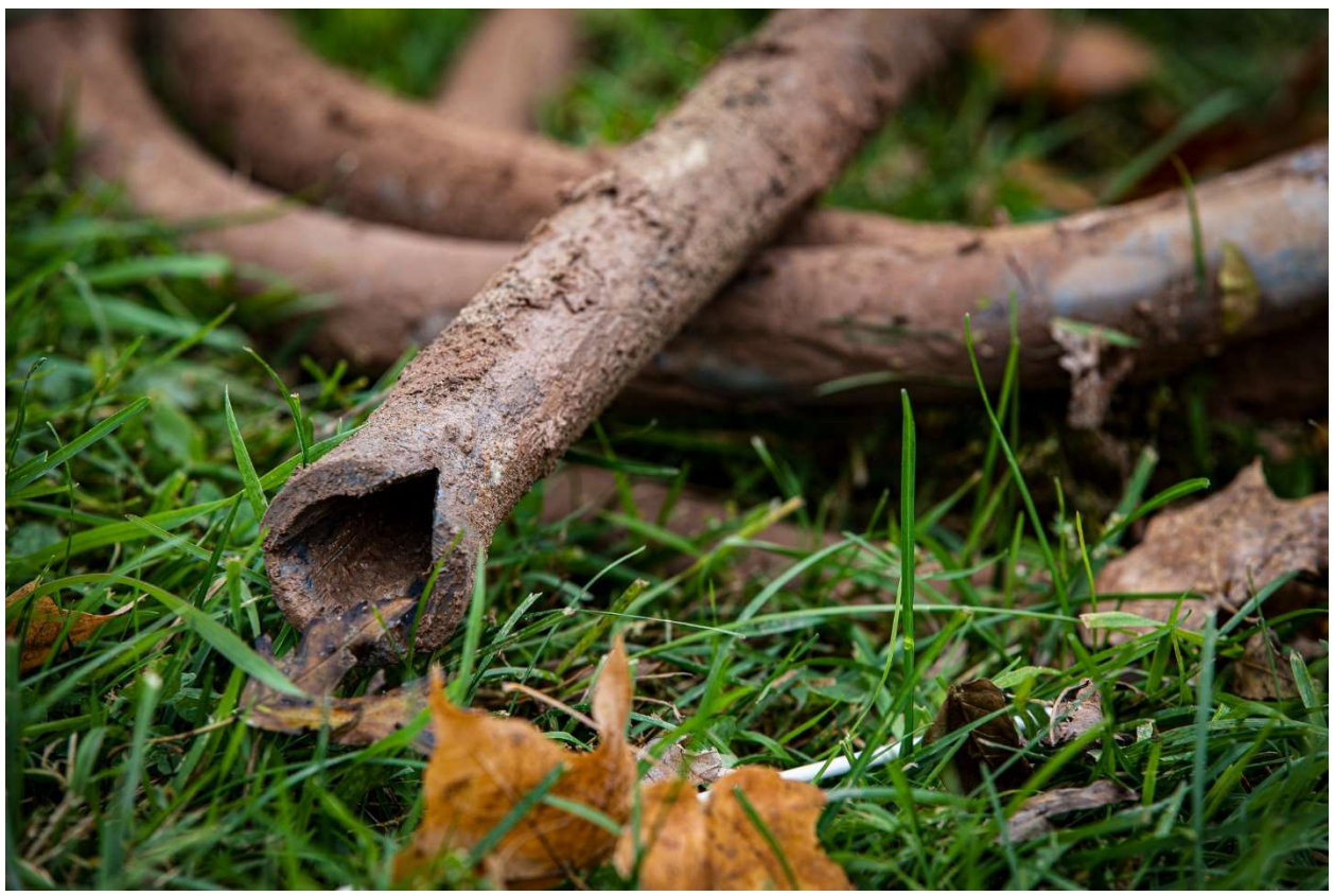
Figure 7: Lead service line