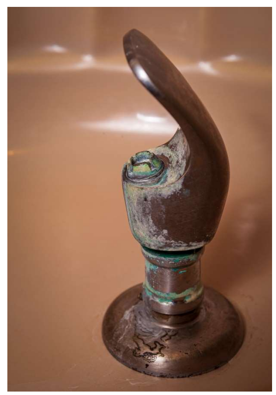
Figure 4: Leaded fitting on a drinking water fountain