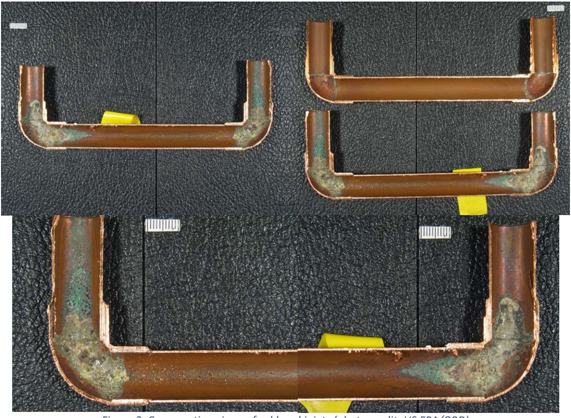
Figure 2: Cross-section views of soldered joints