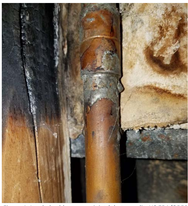
Figure 1: Leaded solder copper joint