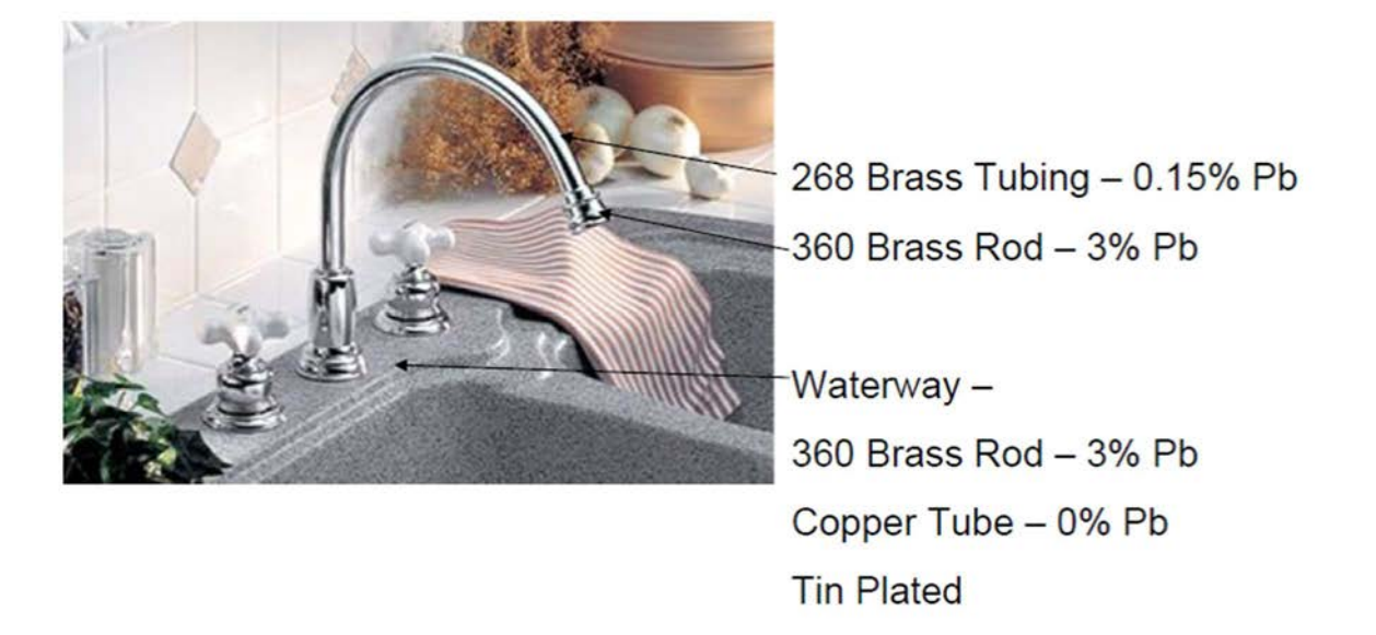
Figure 6: Lead content in plumbing fixture