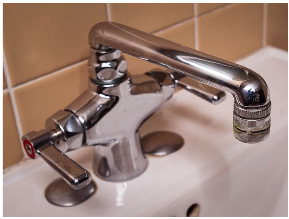
Figure 3: Leaded fitting on a sink faucet