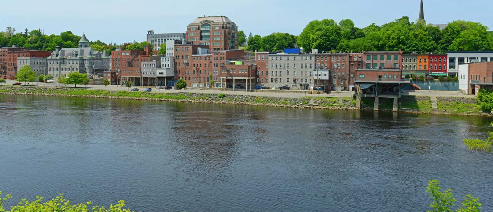
Historic Buildings on the bank of Kennebec River in downtown Augusta, Maine