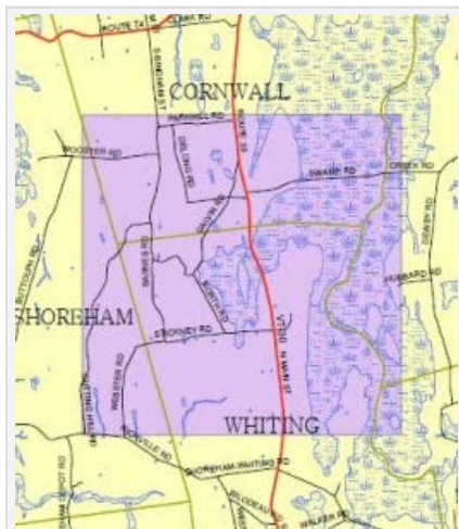
Proposed 2012 Aerial EEE Treatment Areas

Two cases of Eastern Equine Encephalitis (EEE) have been confirmed in humans in Rutland and Addison counties. The Departments have identified the pesticide applications as a means of reducing mosquito populations that carry EEE and West Nile Viruses.