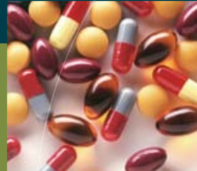
Unintentional Poisoning and Suicide