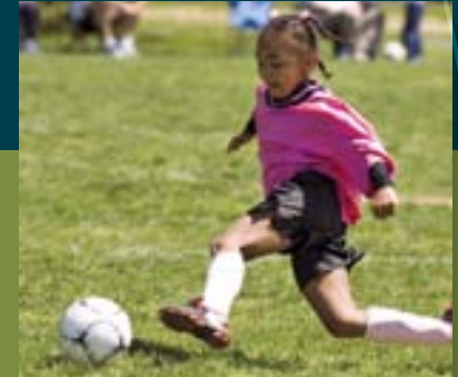
Traumatic Brain Injury