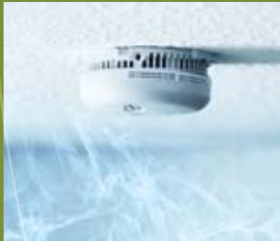
Home and Recreational Safety