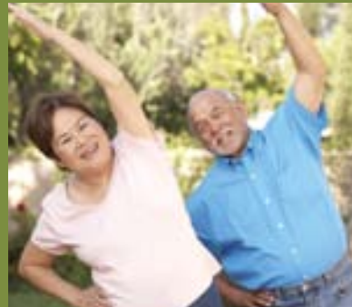
Falls Prevention Among Older Adults