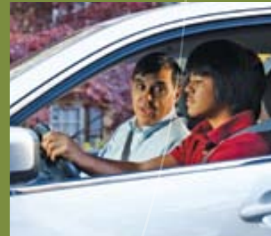
Motor Vehicle Safety

Discover additional strategies for advancing policy change at astho.org