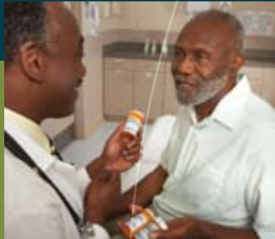
Prescription Drug Overdose