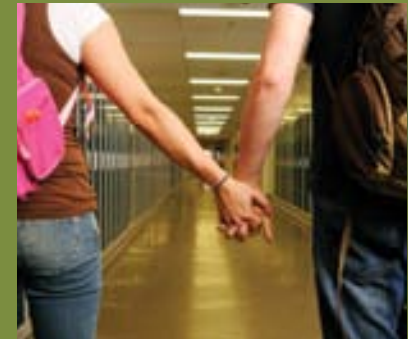
Teen Dating Violence