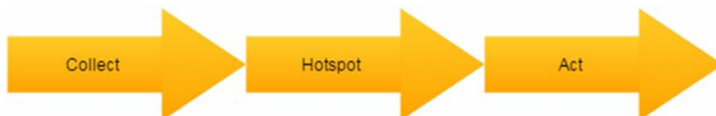
Figure 3: Massachusetts' Vision of Data Integration

Bharel deeply described MA DPH’s data collection activities around data collection. MA DPH plans to be a national leader in innovative, outcomes-focused public health based on a data-driven approach, with a focus on quality public health services and an emphasis on the social determinants and eradication of health disparities.